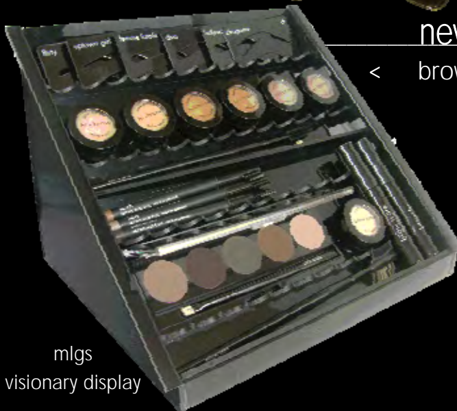
mlgs visionary display