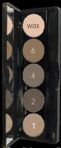
5 well 'brow pallet'