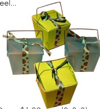
Green $1.00 (3x3x3) Blue $1.00 (3x3x3)

98 judge road, toronto ont M8Z 5B4 tel: 416-233-5383 fax: 416-233-0757 toll free telephone: 1-800-368-0371 email: pinnacle@pinnaclecosmetics.com web site: www.pinnaclecosmetics.com